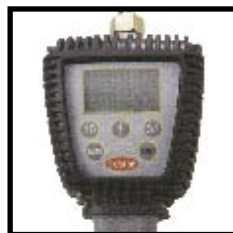
Easy to Read Digital Display