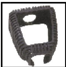
Shock-Proof Rubber Cover