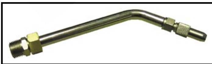
Manual Anti-Drip Tip with Rigid Spout available on request